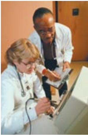
Doctor and nurse working on computer

The word data (DAY-tuh) is plural. It refers to a set of information. The singular form is datum , one piece of information.